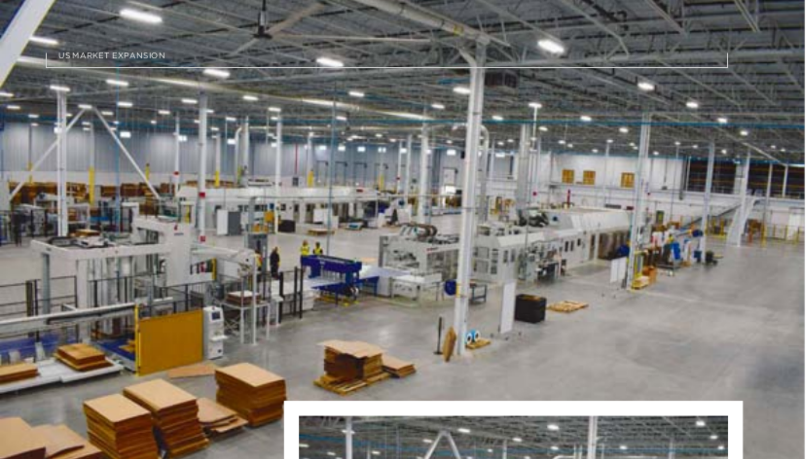
The plant has a 50-inch 4-color Bobst FFG 1228NT RS and a 66-inch 4-color Bobst DRO 1628NT RS RDC.

Automation is key. Our industry does not have the best profit margins. You need some balance and investments in automation and what we did here was a very correct decision."